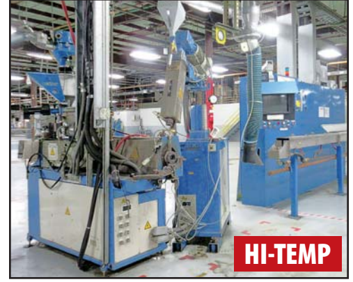
2000 MAPRE 45 MM EXTRUDER + 2" VERTICAL