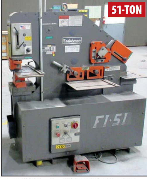
SCOTCHMAN FI-5109-14M HYDRAULIC IRONWORKER