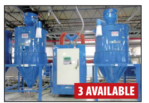
CONAIR HB3000 DRYER W/TWIN 3,000 LB HOPPERS