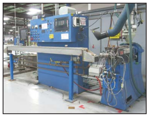
DAVIS STANDARD 1.5" HI-TEMP EXTRUDER