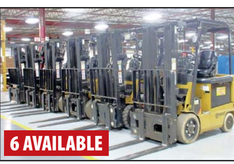
VIEW OF CAT 5,000 LB ELECTRIC FORKLIFTS