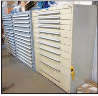
VIEW OF LISTA CABINETS

ALSO: OTC 25-TON HYDRAULIC SHOP PRESS, MIG AND TIG WELD- ERS, PLASMA CUTTER, MAG BASE DRILLS, DRILL PRESSES, DOUBLE-END GRINDERS, LISTA CABINETS, FLAMMABLE FLUID STORAGE CAB-INETS, CANTILEVER RACKING, (200) SECTIONS OF ADJUSTABLE PALLET RACKING, FLOOR SCALES, SCISSOR TABLES, HOTSEY NO. 558 PRESSURE WASHER, ORION H66- 10DT DUAL TURNTABLE STRETCH WRAPPER, HAND AND POWER TOOLS, TOOL CHESTS, RETRACT-ABLE HOSE REELS, VISES, WORK BENCHES, LADDERS, SHOP FANS, ROLLING STAIRS, RIGGING EQUIP- MENT, FLOOR SCALES, ETC.