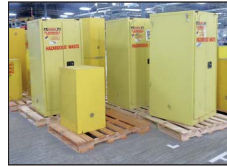
VIEW OF FLAMMABLE LIQUID STORAGE CABINETS

ALSO: OTC 25-TON HYDRAULIC SHOP PRESS, MIG AND TIG WELD- ERS, PLASMA CUTTER, MAG BASE DRILLS, DRILL PRESSES, DOUBLE-END GRINDERS, LISTA CABINETS, FLAMMABLE FLUID STORAGE CAB-INETS, CANTILEVER RACKING, (200) SECTIONS OF ADJUSTABLE PALLET RACKING, FLOOR SCALES, SCISSOR TABLES, HOTSEY NO. 558 PRESSURE WASHER, ORION H66- 10DT DUAL TURNTABLE STRETCH WRAPPER, HAND AND POWER TOOLS, TOOL CHESTS, RETRACT-ABLE HOSE REELS, VISES, WORK BENCHES, LADDERS, SHOP FANS, ROLLING STAIRS, RIGGING EQUIP- MENT, FLOOR SCALES, ETC.