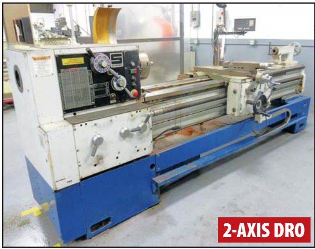
SUMMIT 16X80R GAP BED ENGINE LATHE