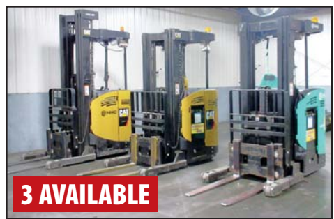
VIEW OF ELECTRIC REACH TRUCKS