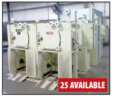
WATSON KINREI 2-POSITION MOTORIZED PAYOFFS