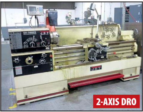
JET GH-1460ZX GAP BED ENGINE LATHE