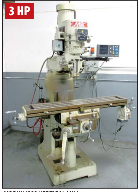
MSC XU6323 VERTICAL MILL

Sale Closes From: Thursday, December 8, 2016 at 10:00 AM MT Monday, December 5 through Wednesday, December 7 from 8:30 AM to 4:30 PM MT Each Day, or By Appointment