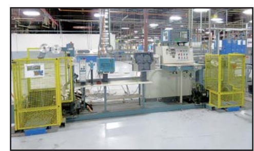
BEAUMONT 22" RESPOOL LINE

WEBER & SCHER 500 MM REWINDER STERLING/DAVIS ELECTRIC CRS 30 RESPOOLER