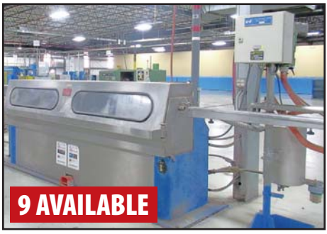
1999 VITEK MBDC-12 MULTI-PASS MIST CAPSTANS