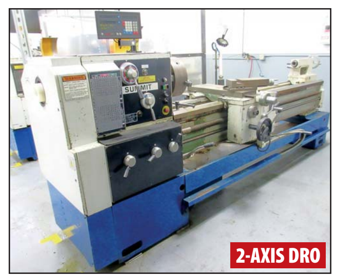
SUMMIT 20X80B GAP BED ENGINE LATHE

from 8:30 AM to 4:30 PM MT Each Day, or By Appointment