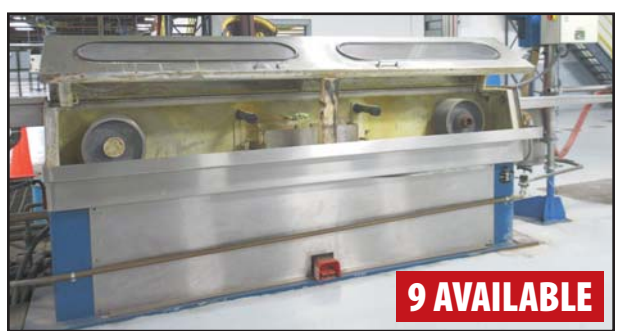
2000 VITEK MBDC-12 MULTI-PASS MIST CAPSTANS