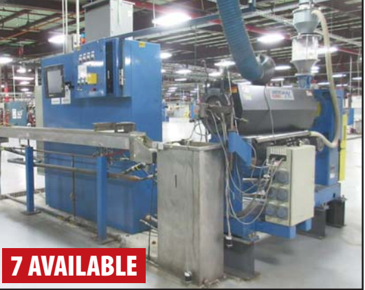
AMERICAN KUHNE AK250 A/C 2.5" 24:1 EXTRUDER

To discuss your requirements for an auction, please call Perfection Industrial 847-545-6374