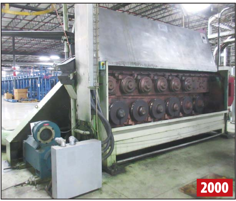
SAMP MT40 12+1 DIE ROD BREAK DOWN MILL

Inspection: Monday, December 5 from 8:30 AM to 4:30 PM MT, or By Appointment