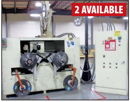
WINDINGS D-1500 REELEX COILING MACHINE