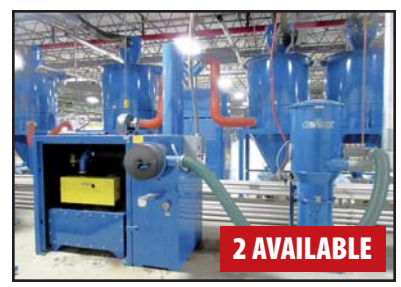
CONAIR PD25 VACUUM LOADER W/DC2 DUST COLLECTOR