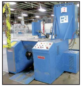
WATSON 36" MOTORIZED SHAFTLESS PAYOFF

ZUMBACH, BETA, CLINTON QUALITY CONTROL EQUIPMENT