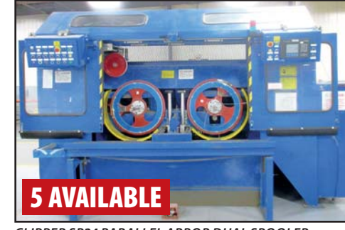
SP24 PARALLEL ARBOR DUAL SPOOLER