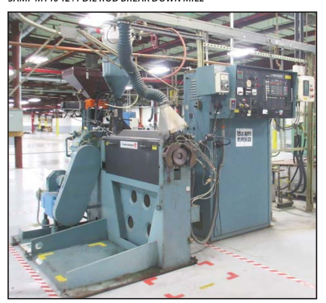
DAVIS STANDARD 20IN20DSPA301 2" 24:1 EXTRUDER

Webcast Bidding Available Through BidSpotter.com