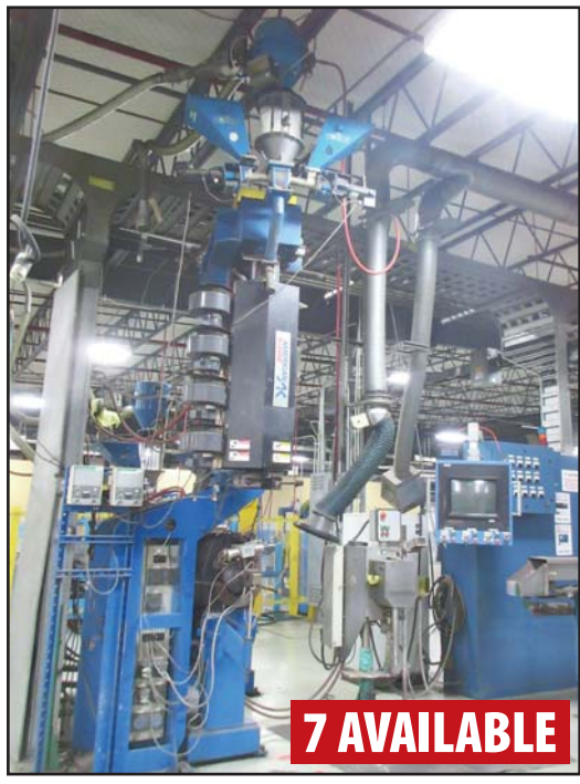
AMERICAN KUHNE 2.5" EXTRUDER + 2" VERTICAL