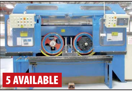
SP24 PARALLEL ARBOR DUAL SPOOLER