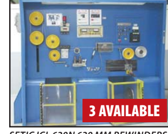
SETIC ICL 630N 630 MM REWINDERS