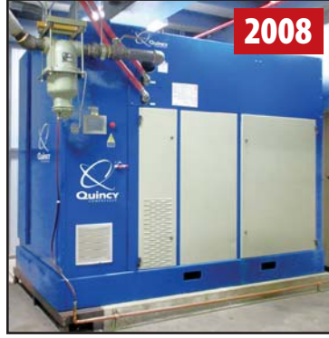
QUINCY QGV-200 AIR COMPRESSOR

SUMMIT CONDEPHASE 80 OIL/ WATER SEPARATOR, s/n 053168004P